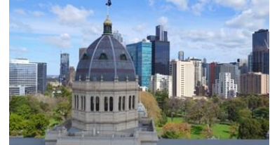
The Royal Exhibition Building dome

'An icon of Melbourne's history has opened its doors to a unique view unseen for 100 years.'