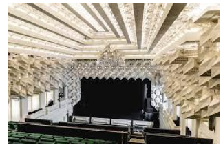
The renovated interior of the Capitol Theatre

A chance to find out more about the fascinating history and unique architecture of the Capitol Theatre, in Swanston Street. Originally designed by celebrated architects Walter Burley Griffin and Marion Mahony Griffin, the Capitol is considered their greatest interior design work.