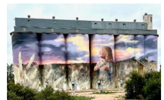
Kimba, on the Eyre Highway

JJ 15 South Australian silo art, water tank and street art adventure (this session will be for two hours, including a coffee break)