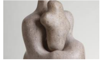
Mother and child sculpture

The doyenne of modernist sculpture, Barbara Hepworth was one of the leading British artists of her generation and the first woman sculptor to achieve international recognition.